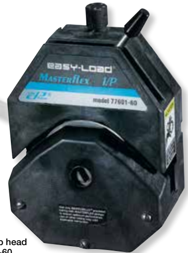
PPS pump head 77601-60