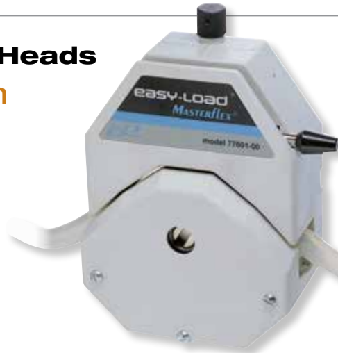
PSF pump head 77602-00